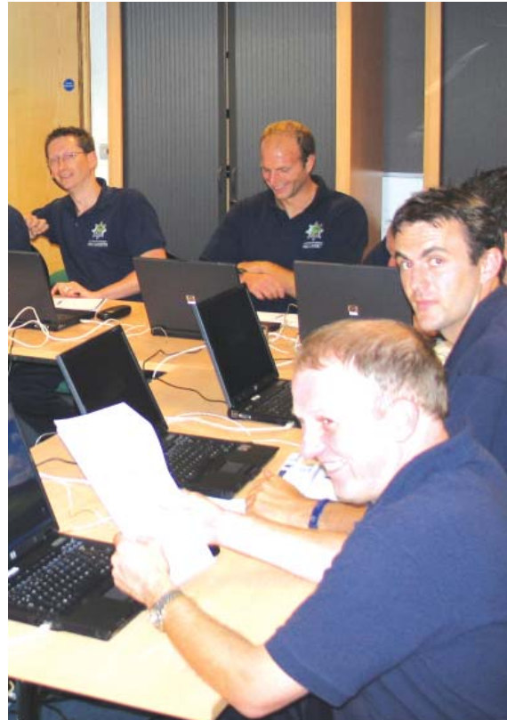
Fire crews from Nottingham enjoying a session of ICT.

As a result of its success we are now working together with Northamptonshire Fire and Rescue Service to run a pilot ICT course based on the Nottinghamshire model.